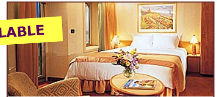
Balcony Cabin from $1,295 per person double occupancy. Singles on request. Sit outdoors, relax, enjoy the privacy and admire the incredible passing scenery.