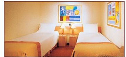
Inside Cabin from $779 per person double occupancy. Singles are on request. Excellent Value at a Special Price!

Click here to book online or call Dee or Laurie (800) 326-1414