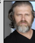
Dan Yeager "Leatherface" in the New Movie: Texas Chainsaw Massacre 3D