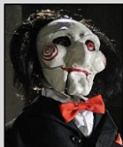
Take a photo with the Puppet!