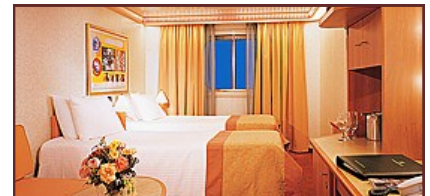
Outside Cabin from $878 per person double occupancy. Singles are on request. Beautiful stateroom windows give gorgeous views of the ocean.