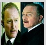
Mark Rolston "Erickson" SAW 5 & 6