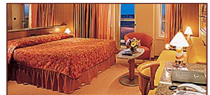
Suite $1,695 per person double occupancy. These extra-large accommodations have a separate sitting area and spacious balcony. Stunning and luxurious!