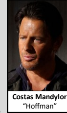
Costas Mandylor "Hoffman"